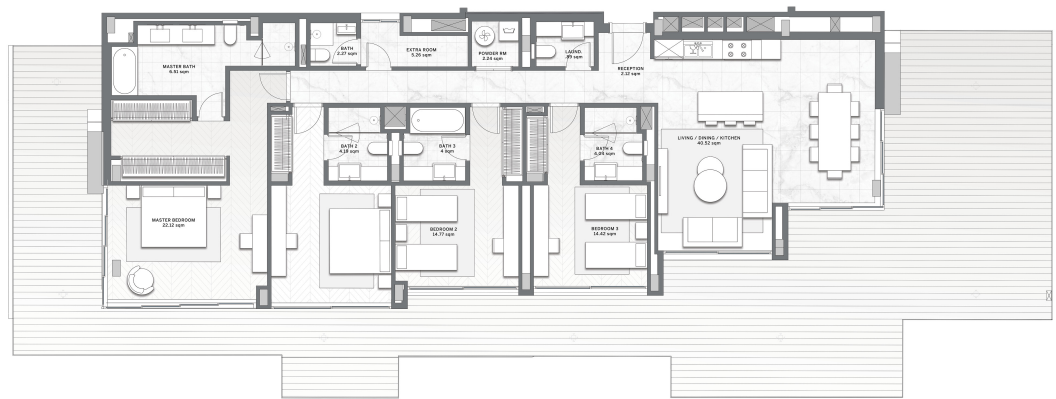
FIRST FLOOR KEY PLAN