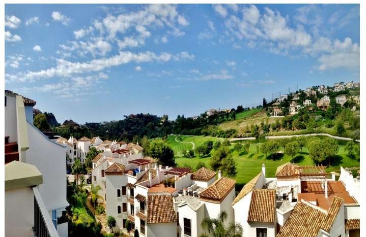
90 sq. mtrs. of rooftop solarium