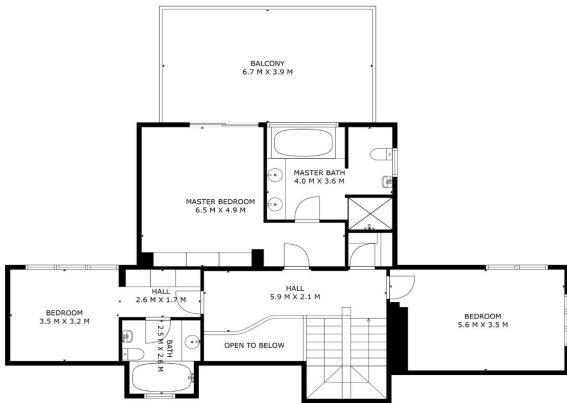
SIZES ARE APPROXIMATE, ACTUAL MAY VARY.